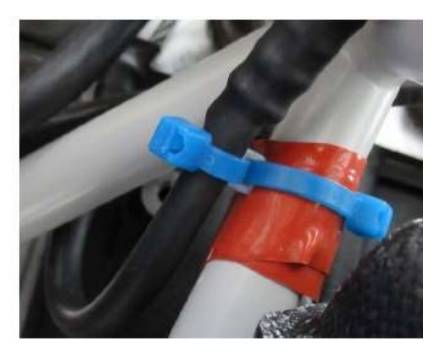
Figure 3. Safety rope at aft right of the engine. Note the silicone tape, spacer, and two zip ties used to secure the safety rope.